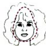
PEAR SHAPED FACE

Hair worn on the forehead is always perfect for you, as long as it is wispy or fringed. Never wear straight bangs. Hair turned under at the bottom also will narrow the width of the jaw. Styles in loose curls and waves add extra dimension to the square face.