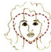
HEART SHAPED FACE

This is a triangular-shaped face. This face is narrow at the jaw line, wider at the eye line, cheek bones and even more at the brow line. The goal: diminish forehead width and create a wider, fuller jaw effect. Soft bangs flatter this shape, whether curly or smoother. Or wear a side part with soft three-quarter bangs swept over one side to balance your forehead width.